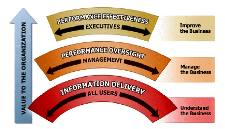
Fig. 2. CPM System Value [8].

The CPM system value is illustrated in Fig. 2. It consists of three levels, which are described in the following parts.