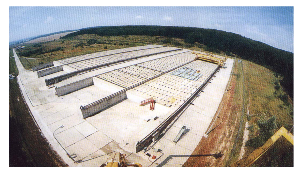
Fig. 1. Bird view on the first finished part of the central storage place.