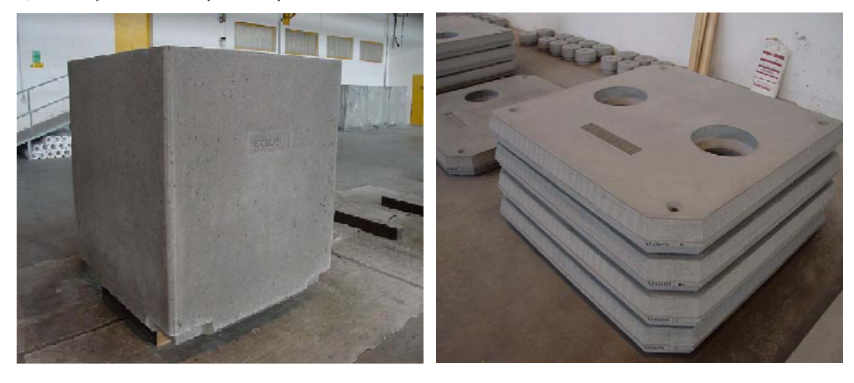
Fig. 6. Precast container body and cover plates made of HPFRC.