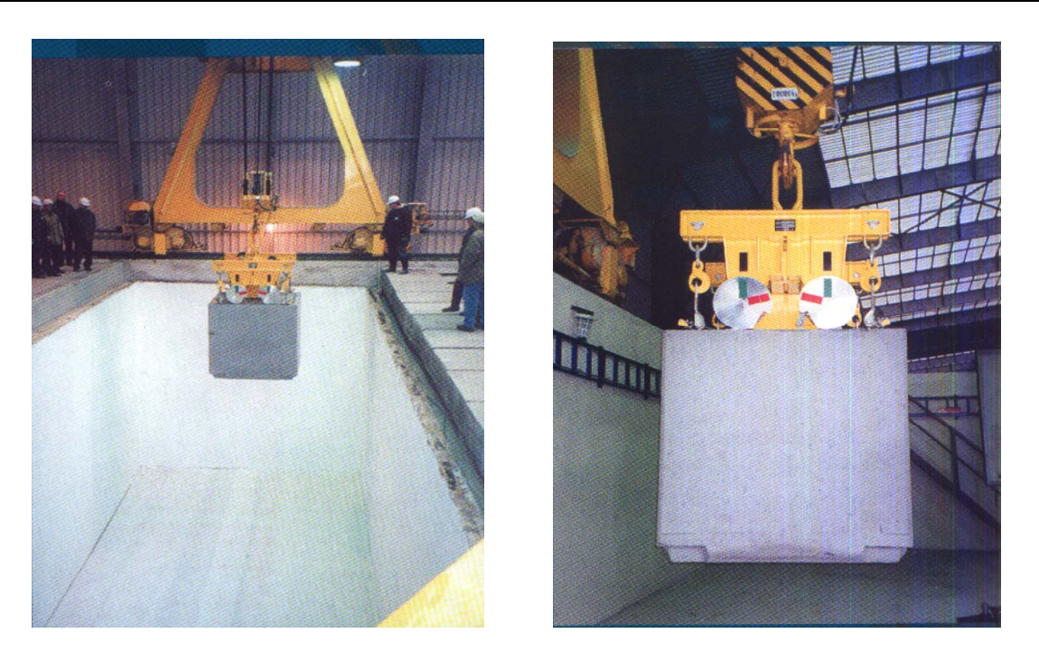
Fig. 3. Manipulation of the container during the process of its placing into the chamber of storage place.

A high quality of HPFRC in the sense of higher strength parameters goes hand in hand with other good physical properties. Because of HPFRC high durability requirements in the life span of 300 years it is necessary to pay attention on the choice of concrete mix constituent, especially the aggregate and cement. In general, the longtime durability of hardened HPFRC has to be appoved by the accellerated test of durability [1], [2]. The process of the concrete mix production is realized in a fully automated plant with an electronic control. There exists a complex quality control at all stages of the container fabrication. The process of concrete mixing is controled by a computer.