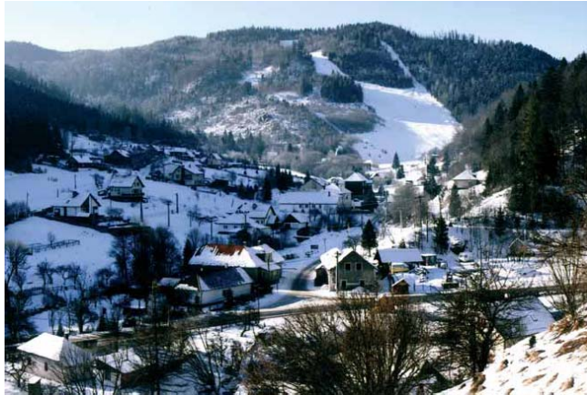
Fig. 1. Location and overview of the Hnilčik micro region

draws a demarcation of four educational trails and installation of information boards, covering remarkable places of famous sites Roztoky, Bindt a Grétla-Cechy (Educational trail history of mining in Hnilčik).