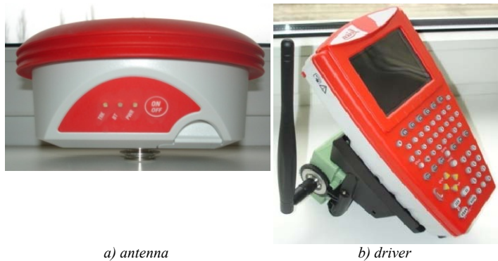
Fig. 3. GNSS receiver.

Data received and collected by GPS and GNSS technologies are currently used for creating 3D GIS, in particular for the creation of digital terrain models and 3D models of buildings (Kuzevičová et al., 2012). Through a suitable GIS application interface, all observed objects in the area of mining tourism can be effectively processed, analysed and visualised. Using a GIS in geotourism (Gregori, Melelli, 2005) and mining tourism through analytical tools supports the possibility of processing various forms of information related to the area of interest. This ability ranks them highly. They also fully support the development of spatial models. Very popular are virtual tours, for example nature trails after mining activities, eventually museum expositions based on the mining activities.