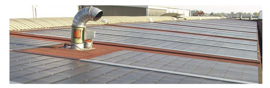
Fig. 3. Roof with PV system Tegola Solar (Ušák, 2014).

In practice, now used in place of the trapezoidal sheet that would have been fitted to the steel girder OSB category 3 of thickness 18 mm, the PV shingles is going to be installed instead. Such PV roof is completely acceptable and meets the standard properties of the roofing. Additionally, this generates electricity while, in our country, this can be considered as an area performance at 68 Wp·m<sup>-2</sup>. The total installed output of the roof module with standard six pieces of PV panels of installed output of 816 Wp, while respecting the distance from the edge of the module for a compulsory part of the PV installation that is the lightning conductor.