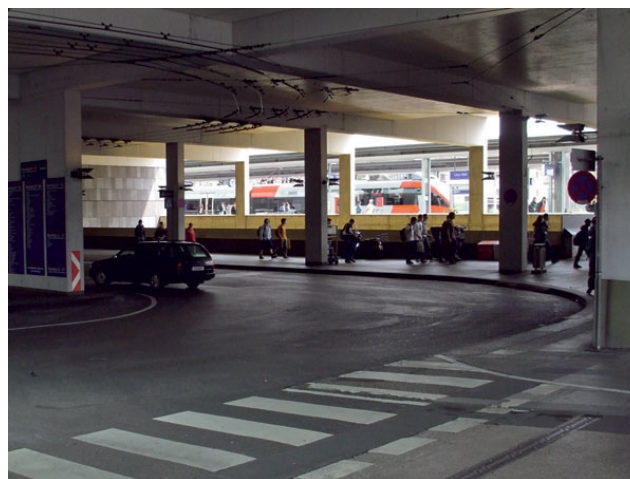
Fig. 4. Terminál Sever- Ťahanovce (Šarak, 2011).

The planned cableway for tourism will be able to connect other cableways in the Anička area, for example, from the settlement Furča and Bankov locality from the settlement KVP. These cableways could also serve as a means of public transport. At the same time, there is the possibility to integrate this transport system into the integrated transport system Košice in Terminal Sever-Ťahanovce (Figure 4).