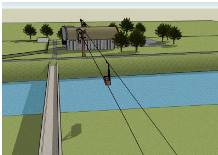
Fig. 2. View of the planned cableway and the Anička station (Balog et al., 2010).

Parking cars can be on land between Anička and route II. the class of Košice - Kysak, under the Podhradová settlement. At the boarding station, a return and tensioning system of the cableway can be placed, and at the same time, a museum devoted to the history of mining and freight cable transport of raw materials in Košice. The exit station of the cableway will be in the area of the amphitheatre, on the mine of Bankov in the places of the former building station and the hopper. The exit station can be a cableway drive, a restaurant, and a garage carriageway. The station can be directly connected to the building of the amphitheatre. In the building of the exit station, there could also be the start-up station of the cableway at the Kamenný Hrb in the future. (respectively Alpínka). A new cableway to the Jahodná through the Kamenný Hrb will be connected to the reconstructed cableway (resp. Alpínka), where it will be necessary to build a station to continue the cableway towards Jahodná and towards Alpínka and Kavečany – Hrešná. Presumed transport capacity of the individual cableway to the Alpínka and the cableway to the zoo in Kavečany will be around 1200 persons/hour and a cableway to Kamenný hrb – Jahodná around 600 persons/hour. Based on statistical data, it is reported that Bankov would visit 340,000 tourists each year, Jahodná 100 000 tourists and Kavečany (ZOO and Hrešná) 180 000 tourists.