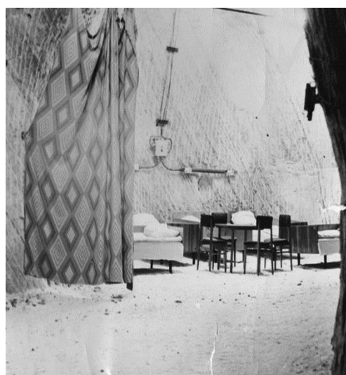
Fig. 2. The photos of the speleological hospital on the basis of 1 st Berezniki mine

The history of modern speleotherapy dates back to the 50s of the XX century. At this time, speleotherapeutic hospitals appear in a number of countries of Eastern and Central Europe, which had numerous