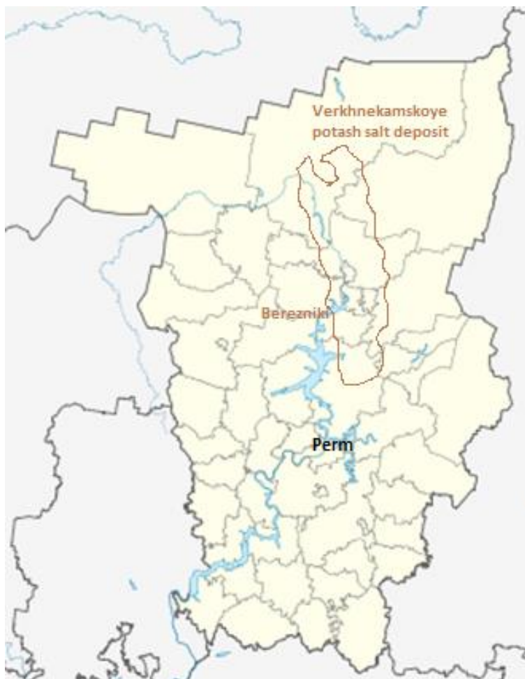
Fig. 3. The location of the Verkhnekamskoye potash salt deposit on the map of the Perm region (Perm Krai).

Such cities as Berezniki and Solikamsk in the West-Ural region of the Russian Federation are an example of such cities and such mining enterprises, where the Verkhnekamskoye potash salt deposit (Fig. 3), which has large deposits of sylvinit and carnallite, is being developed.