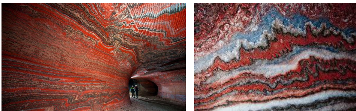
Fig.5. Walls and ceiling of the Uralkali's mine in Berezniki and Solikamsk

The development of the field is conducted by the town-forming enterprise OJSC Uralkali. The mine workings pass through salt beds, extending in one direction up to 10 km. The corridors and rooms of the mines have incredible beauty, not just healing properties (Fig. 5).