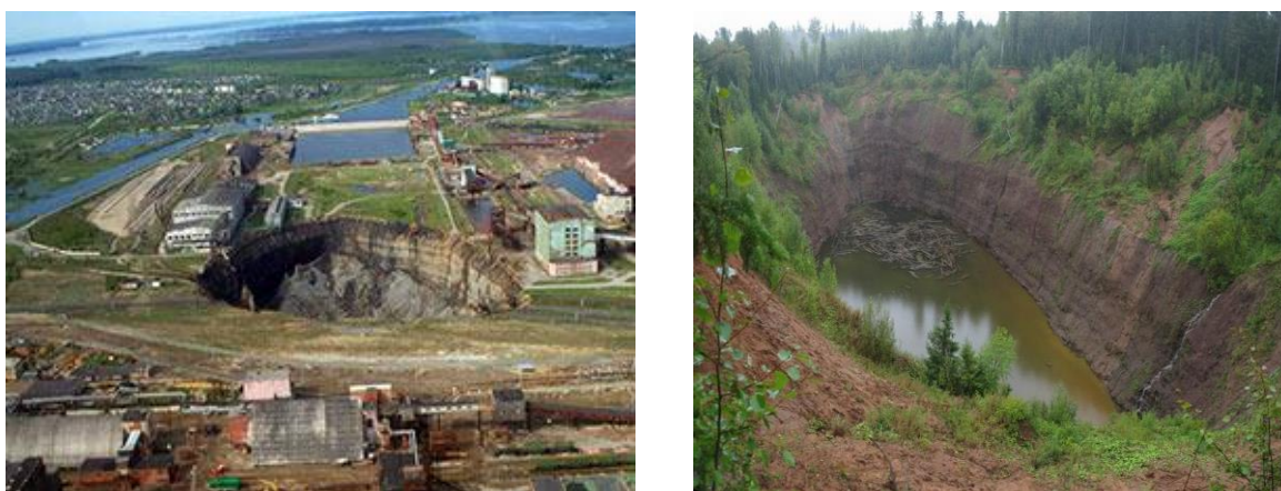
Fig.1. The craters from the failures of the mines of the Bereznikovsky mine department

However, there can be some problems. In particular, dumps taken to the surface or waste rock, dips in the soil after the extraction of minerals, faults and washouts and other negative phenomena that spoil the natural landscape remain in the environment after mining. “Dumps after underground mining usually remain like stars on the appearance of the landscape” (Hronček and Rybár, 2016). “The open craters filled with water and garbage, having steep, unstable slopes represent most of the abandoned quarry sites, raising public health and safety concerns additionally to unpleasant environments” (Jayawardena et al., 2018). For example, Figure 1 shows the photographs of two craters from the failures of the mines of the Bereznikovsky mine department (Russia, Perm region). The first crater is located right in the city center between the buildings threatening their safety. The second crater is located outside the city above one of the mines that were flooded by the earthquake.