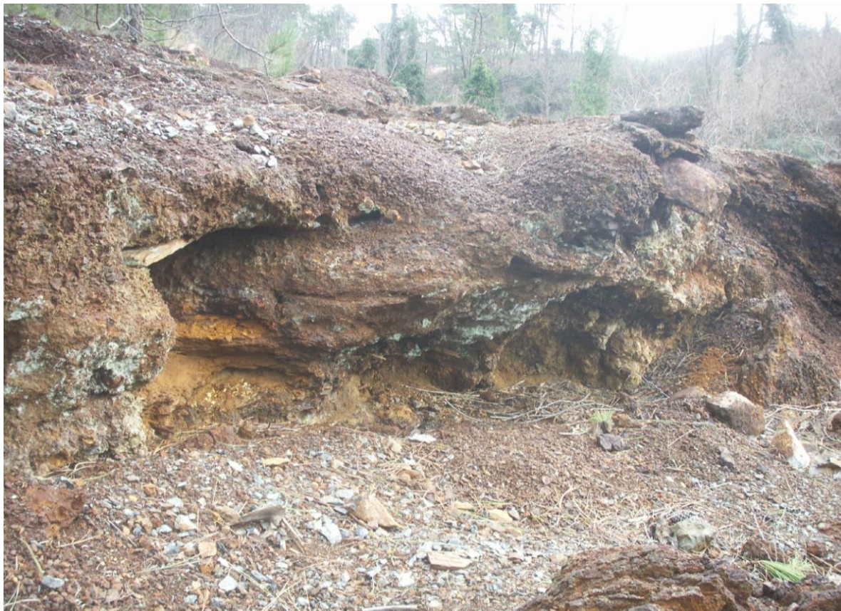
Fig. 3. Libiola southern dump.

We must also underline that in samples G-1, G-2 e G-3 (collected under an olive tree), zinc and cobalt also exceed limit A (Law 152/06).