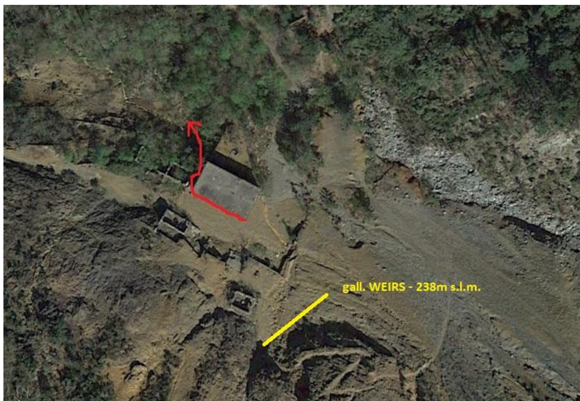
Fig. 5. Map (from Google) representing the northern side of Libiola mining area, also showing the location of Weirs Gallery. The arrow indicates water flow from Weirs Gallery, through a small channel, in the direction of the area where samples G-13 to G-17 were collected (fig. 4).

With regard to it, it is necessary to underline that some pools for copper cementation were present in the surroundings of the main building in the past: as a matter of fact, some iron shavings can be found in the surroundings of the area (probably used to activate oxido-reduction processes to water flowing out from Weirs Gallery). It is thus plausible that defluxe interesting this area shows very high concentrations that, without pools, can reach Rio Boeno stream and justify higher concentrations in that point. Whereas, in the past, water flowing out from Weirs Gallery passed through pools, nowadays this water directly reaches Rio Boeno stream.