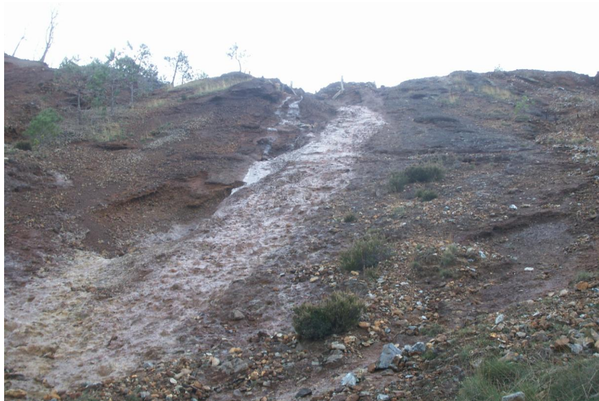
Fig. 4. Dumps on the northern side of Libiola mining area.

Among these samples, G-15 is the one showing the highest contamination because of copper, nickel, cobalt, chromium, and zinc. It also shows a high concentration of vanadium. High concentrations of copper, cobalt, chromium, and zinc can also be due to the presence of a small creek river draining a part of the dump-field and flowing in a small channel upstream of the main building (Fig. 5). As a matter of fact, it joins Rio Boeno stream more or less where G-15 is located. It could justify high concentrations of copper, cobalt, chromium, and zinc, which, on the contrary, should decrease westwards from sample G-13 to sample G-17, as sampling points are farther from Rio Boeno stream, with the consequence that dilution could be expected.