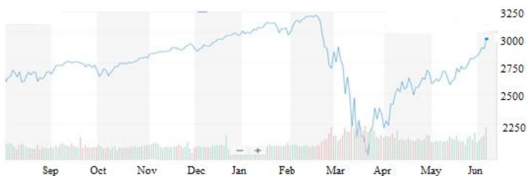
Fig. 3. Index S&P 500.