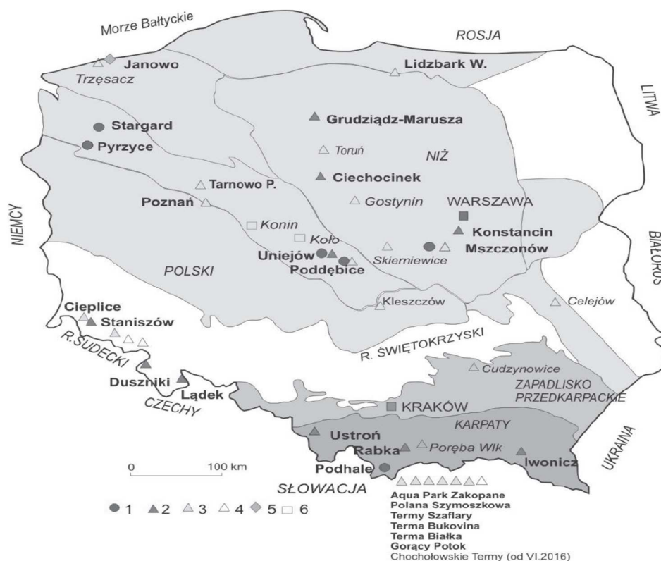
Fig. 1. Geothermal installations in Poland

In Figure 1, the geothermal installations in Poland are mapped.