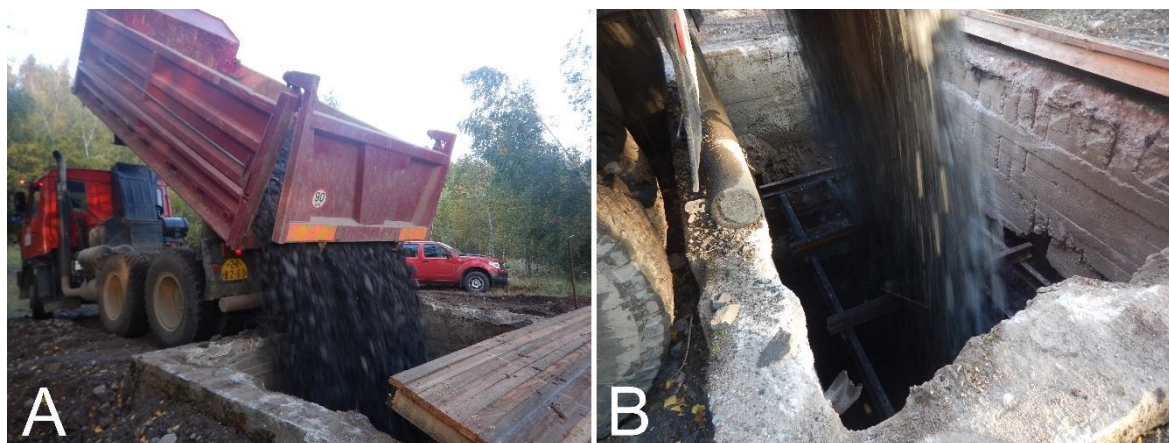
Fig. 3. Example of cyclic backfill of the exploration pit Š11

In the implementation of backfilling, the pit head must be fitted with a grid of 250 x 250 mm mesh size and a feeding hopper to direct the backfill – see Fig. 3b. The pit head should also be fitted with a stop to prevent the trucks from falling into the shaft profile. The backfill can continuously be transported into the mine workings using a belt or drag conveyors or cyclically dumped from trucks' bodies or loaders – see Figure 3a.