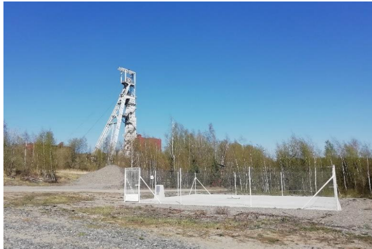
Fig. 5. Closing sinking platform of R2 shaft in the former Rožná II mine

The micropilots are joined to the foundation belt by leading the reinforcing micropilot tubes into the lower part of the foundation belt. Next, via welding steel plates of 0.2 x 0.2 m, a thickness of 20 mm, a foundation for the steel construction of the sinking platform is made. It is advisable to leave a lockable aperture of minimum dimensions of 0.6 x 0.6 m in the closing sinking platform to be able to check the inundation of the shaft and possible extra backfilling.