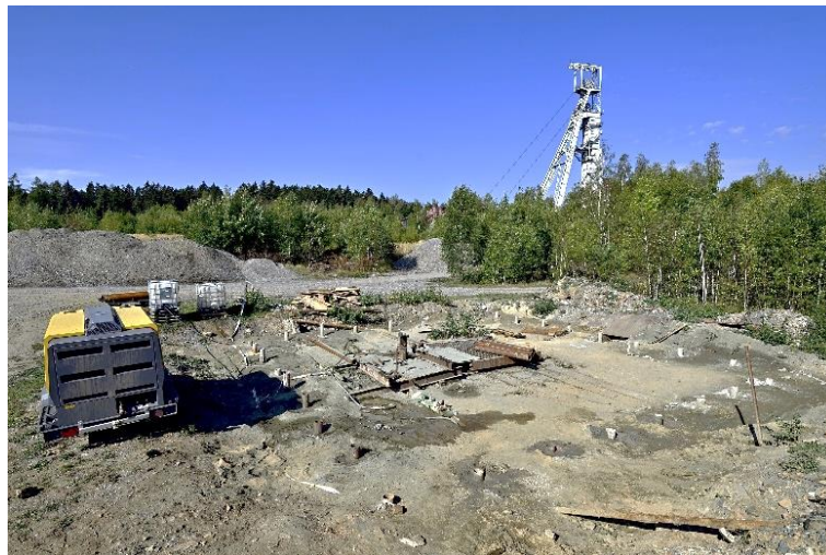
Fig. 4. Micropilots in a foundation belt of R2 shaft in the former Rožná II mine

The closing sinking platform should be built at the mine working shaft mouth as a reinforced concrete square platform made of C30/37 concrete and reinforced with continuous bidirectional concrete reinforcement Ø 22, B500A. This reinforced concrete square platform should be placed on the hard floor or possibly a foundation belt made of C30/37 concrete. The dimensions of the foundation belt should be at least 1.0 x 1.0 m, and it should be anchored into the solid rock mass in the bedrock using micropilots – see Fig. 4.