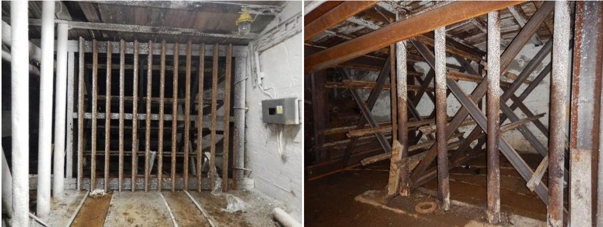
Fig. 2. Welded steel construction of a reinforcing dam on the 5th level of B1 shaft