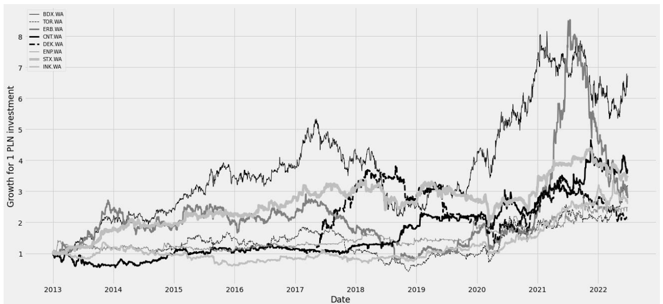
Fig. 2 Growth of investment in the Polish market.

As Fig. 1 shows, although for some companies the risk occasionally reached a level above 40%, for most companies, it remained within 10-20%.