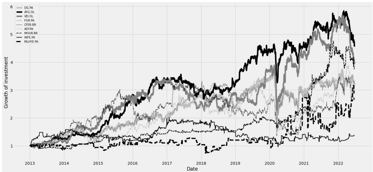
Fig. 3 Growth of investment on Euronext (Note: calculations made for the ingredients of the optimal portfolio).

The companies AF Gruppen (AFG.OL) and Veidekke (VEI.OL), as representatives of chosen Euronext portfolio, have secured almost 6-times (almost 500%) growth of investment for their shareholders (Fig. 3).